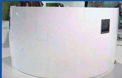
Fan Cowl – After