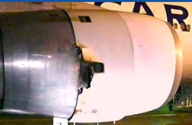
Fan Cowl – Before