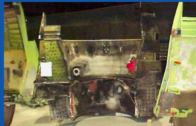
Reverser – Before