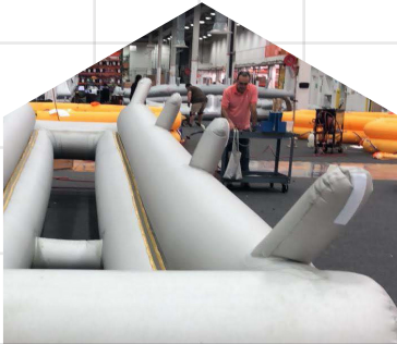
1. Testing CMM