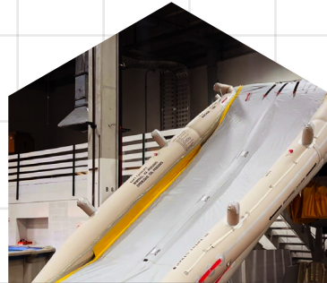
2. Sill Height Testing Deployment