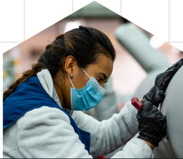
4. Burst Pressure Testing