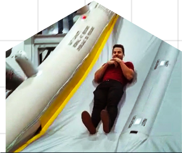
3. Beam Strength Testing

EASA FAA APPROVED; A DUAL RELEASE 8130-3 WILL BE ISSUED WITH EACH REPAIR!