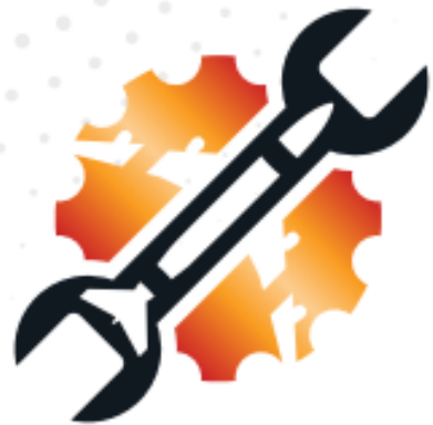
Ease of Maintenance

At FCAH Aerospace, we are committed to providing innovative solutions that can help support your business objectives. Our PMA solutions are designed to help your organization reduce costs, increase durability, and improve turn-around time. We have Girt Assembly, Cylinders, and Portable Studs that support various fleets that are available for purchase today. Additionally, we are the exclusive distributor of PMA roller systems for cargo aircraft through First Class Air Support.