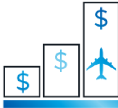
Reduced Cost and Increased Durability